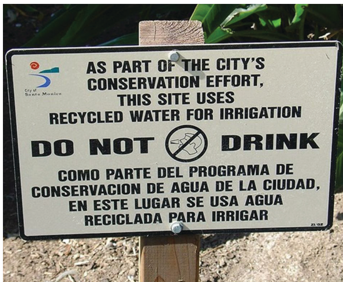
Figure 3. Advisory sign alerting the public to avoid drinking reclaimed water.

Throughout Florida (and the rest of the United States), reclaimed water is transmitted in purple pipes that are kept separate from the pipes that transmit drinking-quality water. Areas that use reclaimed water must also post signs to alert the public of its use (Figure 3). For example, communities that use reclaimed water may post a sign at the neighborhood entrance, and golf courses may post signs at the first and tenth tees. Advisory signs must also include the warning in English and Spanish, "Do Not Drink" and "No Tomar," respectively. Additionally, if reclaimed water is used in a fountain or stored in a pond, it must include an advisory sign that says "Do Not Swim" or "No Nadar" in Spanish.