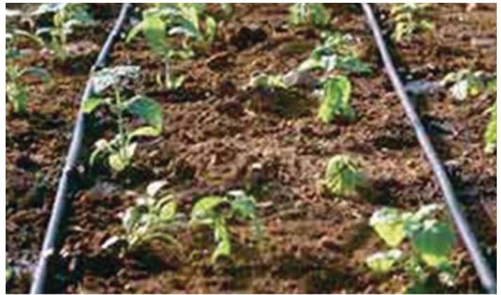
Figure 2. Drip irrigation with reclaimed water.

Any potential problems associated with using reclaimed water on landscape plants can usually be avoided by irrigating only when necessary, growing salt-tolerant plant species, and minimizing the use of overhead sprinkler irrigation so that high-salt water does not contact plant foliage (Figure 2).